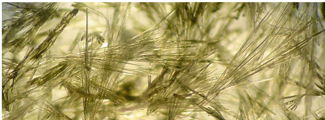
Above photograph: Salvinorin crystals submerged in naphtha.

This extraction and refinement method was worked out and written by an amateur experimenter. I'm not an organic chemist and don't work in a field related to botany or chemistry. The solvents mentioned in this document are very flammable and can be easily ignited by red hot surfaces, open flame, electric or static spark! Avoid risking electric or static sparks from any source and don't try to evaporate solvents in closed areas. Do not use stirring utensils, containers or seals which can react with solvents as any contamination by plastics will completely ruin the extraction which then must be thrown away. This document does not contain enough information to know how to safely handle solvents or their proper use for the manufacture of human consumable products and is not intended to imply that anything produced by this method can safely be used as a food or drug.