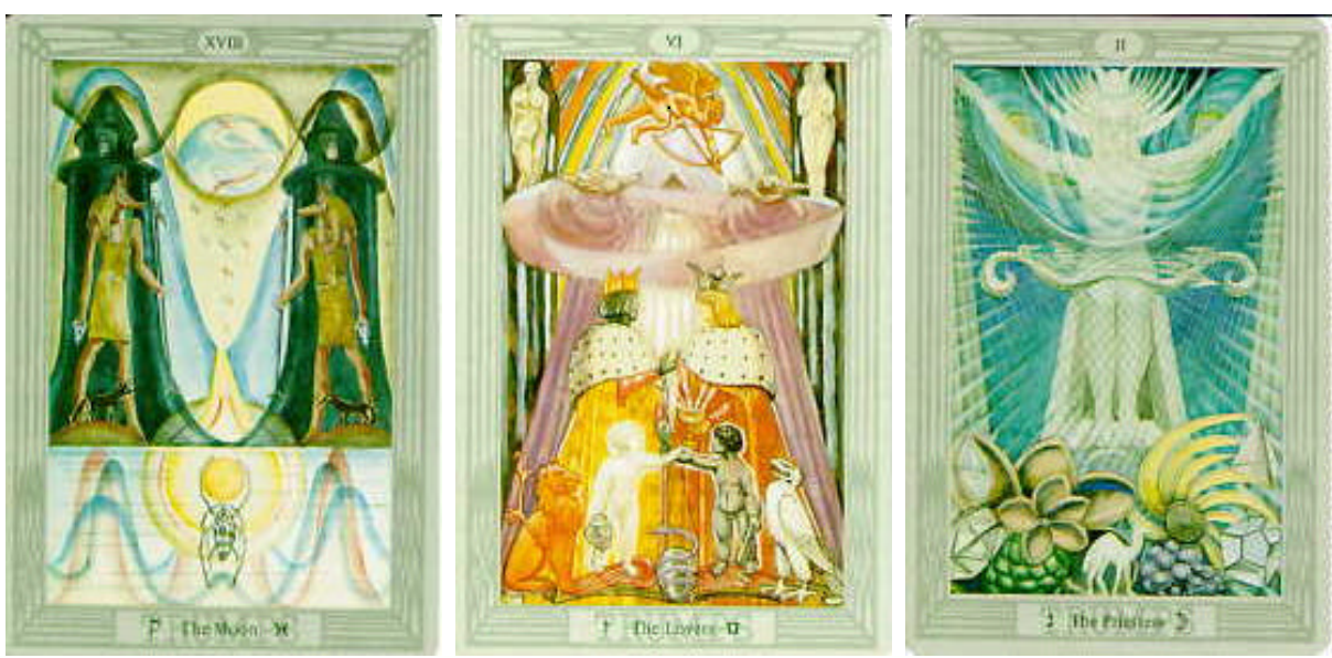
The Moon, the Lovers, and the Priestess from the Thoth deck.

1938-1943: Aleister Crowley designed the Thoth deck, which was painted by Lady Frieda Harris. Though Crowley published his study of the Tarot, The Book of Thoth in 1944, the deck itself was not published until 1969, by which time both designer and artist were dead. Thoth is the Egyptian god said to be the inventor of hieroglyphics. Like the Waite-Smith deck, the Thoth deck is full of esoteric symbolism, combining important symbolic aspects of earlier decks with Kabbalistic, astrological and alchemical references.