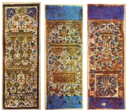
Islamic Mumlak cards, 15th century

1375-1378: Playing cards were introduced to Europe from the Islamic invasion of North Africa, Spain and Sicily by Islamic forces during the Mamluk Sultanate of Egypt which did not end until 1517. These playing cards were an adaptation of the Islamic Mamluk cards which had suits of cups, swords, coins, and polo sticks (seen by Europeans as staves). The court consisted of a king and two male underlings.